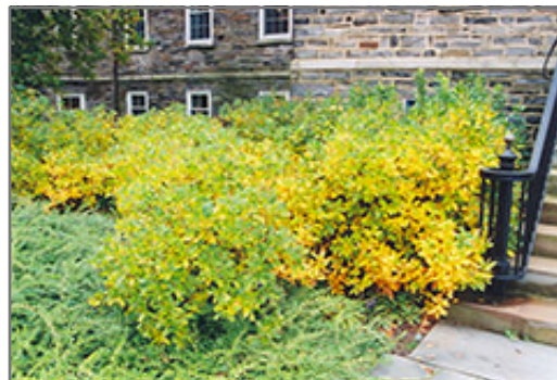
Summersweet in fall

Summersweet is recommended for the following landscape applications;