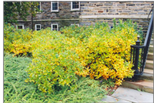
Summersweet in fall