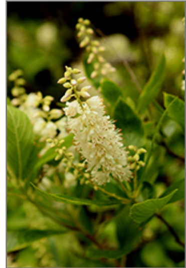
Summersweet flowers

Summersweet is recommended for the following landscape applications;