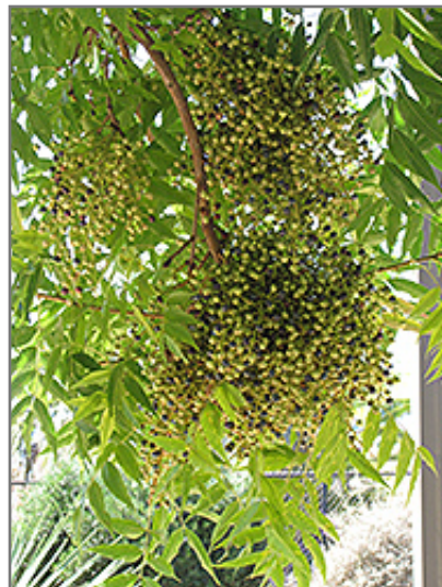
Chinese Pistache fruit

* This is a 'special order' plant - contact store for details