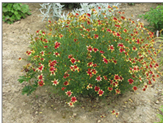
Route 66 Tickseed