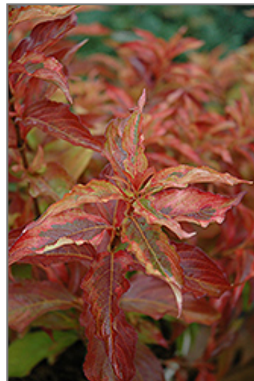
My Monet Sunset Weigela in fall

My Monet Sunset Weigela makes a fine choice for the outdoor landscape, but it is also well-suited for use in outdoor pots and containers. It is often used as a 'filler' in the 'spiller-thriller-filler' container combination, providing a mass of flowers and foliage against which the thriller plants stand out. Note that when grown in a container, it may not perform exactly as indicated on the tag - this is to be expected. Also note that when growing plants in outdoor containers and baskets, they may require more frequent waterings than they would in the yard or garden.