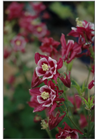
Winky Red And White Columbine flowers

Winky Red And White Columbine is recommended for the following landscape applications;