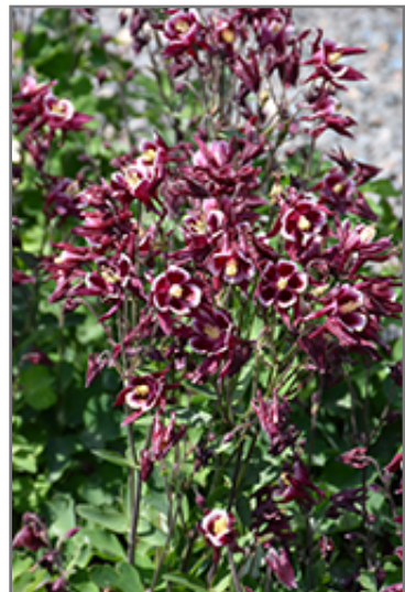
Winky Red And White Columbine flowers