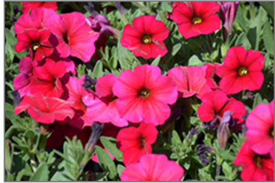
SuperCal Cherry Petchoa flowers

SuperCal Cherry Petchoa is recommended for the following landscape applications;