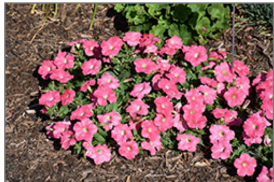
Supertunia Bermuda Beach Petunia in bloom