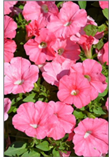
Supertunia Bermuda Beach Petunia flowers