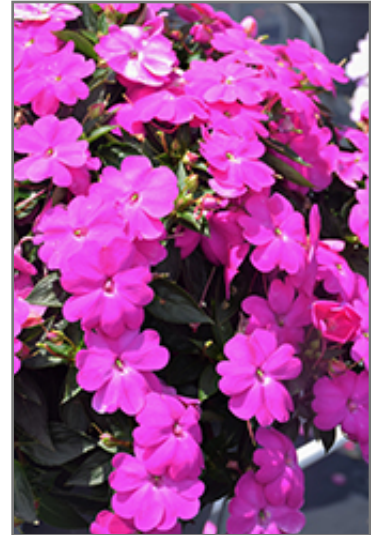
SunPatiens Compact Lilac New Guinea Impatiens flowers

This plant will require occasional maintenance and upkeep, and should not require much pruning, except when necessary, such as to remove dieback. It is a good choice for attracting bees and butterflies to your yard. It has no significant negative characteristics.