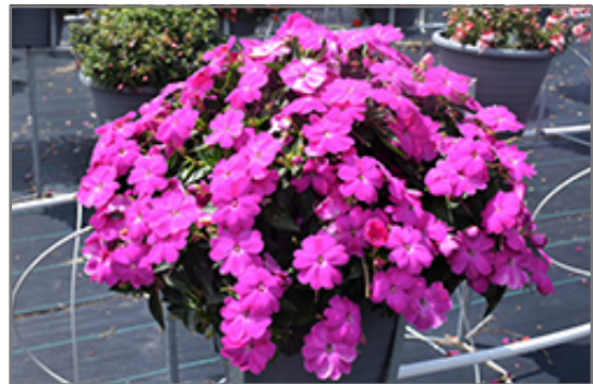
SunPatiens Compact Lilac New Guinea Impatiens in bloom