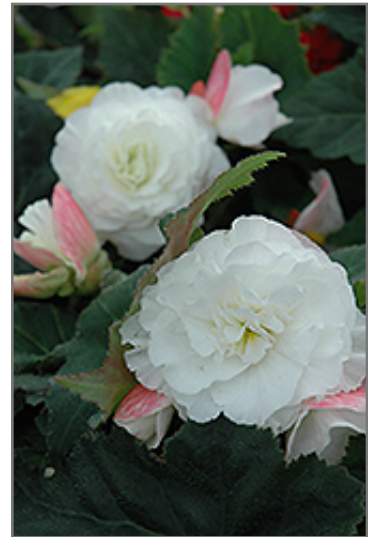
Nonstop Appleblossom Begonia flowers

A spectacular upright begonia presenting lovely dark, heart-shaped foliage; large, colorful double blooms are produced throughout the season; grows well in hot and humid conditions; great for containers, hanging baskets or garden landscapes