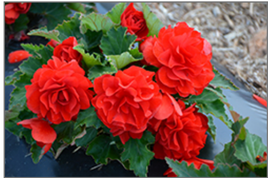
Nonstop Red Begonia in bloom

Nonstop Red Begonia is recommended for the following landscape applications;