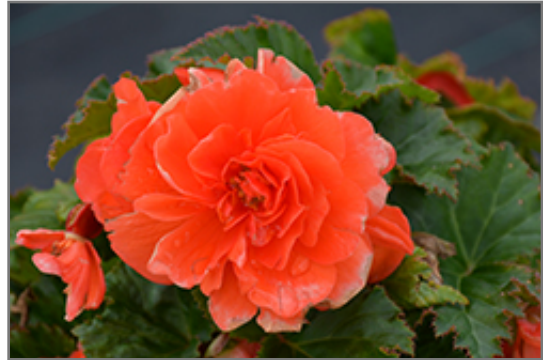
Nonstop Salmon Begonia flowers

Nonstop Salmon Begonia is recommended for the following landscape applications;