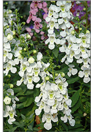
Serena White Angelonia flowers

Serena White Angelonia is a fine choice for the garden, but it is also a good selection for planting in outdoor containers and hanging baskets. With its upright habit of growth, it is best suited for use as a 'thriller' in the 'spiller-thriller-filler' container combination; plant it near the center of the pot, surrounded by smaller plants and those that spill over the edges. Note that when growing plants in outdoor containers and baskets, they may require more frequent waterings than they would in the yard or garden.