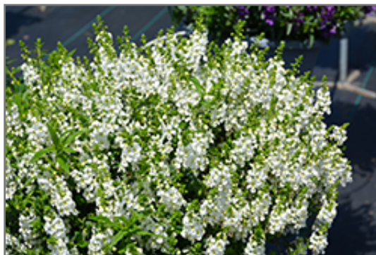
Serena White Angelonia in bloom