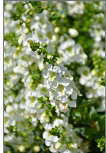
Serenita White Angelonia flowers

Serenita White Angelonia is an herbaceous annual with an upright spreading habit of growth. Its relatively fine texture sets it apart from other garden plants with less refined foliage.