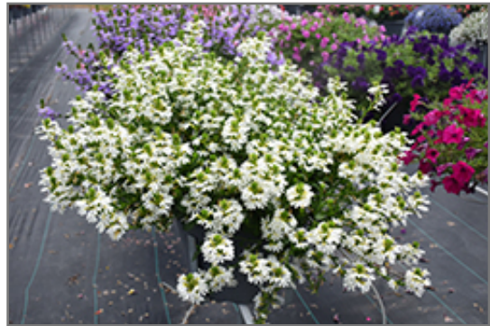
Whirlwind White Fan Flower in bloom