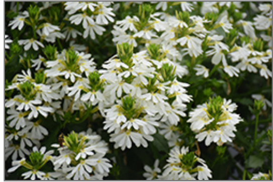
Whirlwind White Fan Flower flowers

Whirlwind White Fan Flower is recommended for the following landscape applications;