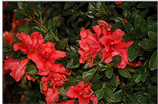
Encore Autumn Princess Azalea flowers

Clustered salmon pink double blooms cover this azalea in mid-spring with additional, lighter flushes in summer and fall; deep green glossy foliage turns deep burgundy in fall and winter; needs highly acidic and organic soil that is well drained