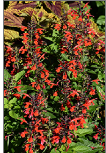
Forest Fire Sage flowers

Forest Fire Sage is recommended for the following landscape applications;