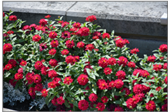
Profusion Double Hot Cherry Zinnia in bloom