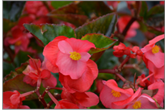
Big Rose Green Leaf Begonia flowers