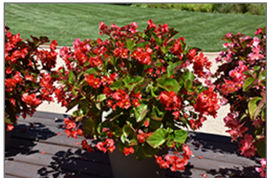
Whopper Red Green Leaf Begonia flowers