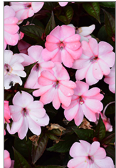
SunPatiens Compact Blush Pink New Guinea Impatiens flowers