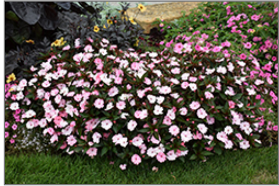
SunPatiens Compact Blush Pink New Guinea Impatiens in bloom

This plant will require occasional maintenance and upkeep, and should not require much pruning, except when necessary, such as to remove dieback. It has no significant negative characteristics.