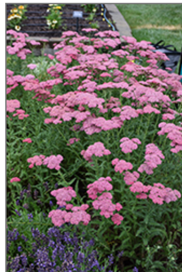
New Vintage Rose Yarrow in bloom