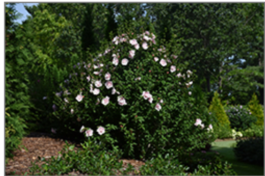
Pink Chiffon Rose of Sharon in bloom