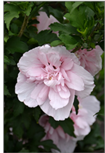
Pink Chiffon Rose of Sharon flowers

This is a high maintenance shrub that will require regular care and upkeep, and is best pruned in late winter once the threat of extreme cold has passed. It is a good choice for attracting butterflies and hummingbirds to your yard, but is not particularly attractive to deer who tend to leave it alone in favor of tastier treats. Gardeners should be aware of the following characteristic(s) that may warrant special consideration;