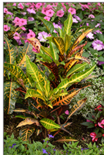
Variegated Croton