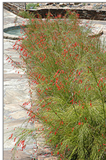
Firecracker Plant in bloom

Firecracker Plant is a fine choice for the garden, but it is also a good selection for planting in outdoor containers and hanging baskets. Because of its height, it is often used as a 'thriller' in the 'spiller-thriller-filler' container combination; plant it near the center of the pot, surrounded by smaller plants and those that spill over the edges. It is even sizeable enough that it can be grown alone in a suitable container. Note that when growing plants in outdoor containers and baskets, they may require more frequent waterings than they would in the yard or garden.