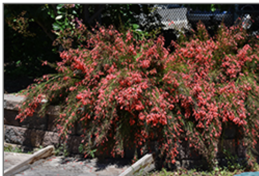
Firecracker Plant in bloom