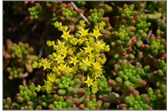
Jelly Bean Plant flowers

Jelly Bean Plant will grow to be only 5 inches tall at maturity, with a spread of 14 inches. When grown in masses or used as a bedding plant, individual plants should be spaced approximately 10 inches apart. Its foliage tends to remain low and dense right to the ground. It grows at a medium rate, and under ideal conditions can be expected to live for approximately 10 years. As an evergreen perennial, this plant will typically keep its form and foliage year-round.