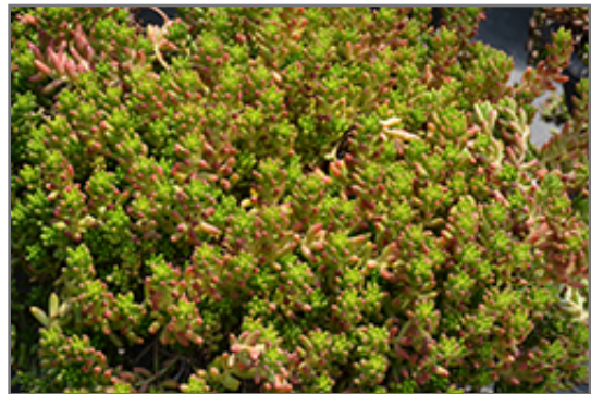
Jelly Bean Plant