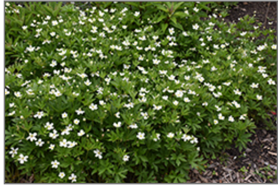
Windflower in bloom

Windflower will grow to be about 12 inches tall at maturity, with a spread of 18 inches. Its foliage tends to remain dense right to the ground, not requiring facer plants in front. It grows at a fast rate, and under ideal conditions can be expected to live for approximately 10 years. As an herbaceous perennial, this plant will usually die back to the crown each winter, and will regrow from the base each spring. Be careful not to disturb the crown in late winter when it may not be readily seen!