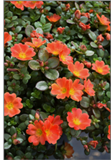
Mojave Tangerine Portulaca flowers

Mojave Tangerine Portulaca is recommended for the following landscape applications;