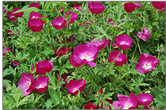
Buffalo Poppy flowers