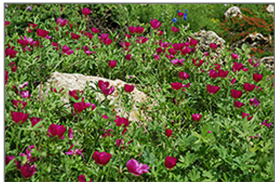
Buffalo Poppy flowers