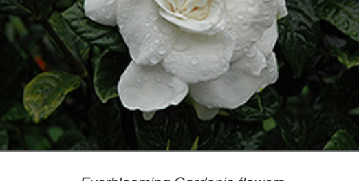
Everblooming Gardenia flowers