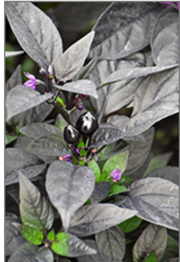
Black Pearl Ornamental Pepper fruit