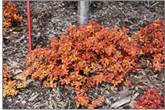
Double Play Candy Corn Spirea

This shrub should only be grown in full sunlight. It prefers to grow in average to moist conditions, and shouldn't be allowed to dry out. It is not particular as to soil type or pH. It is highly tolerant of urban pollution and will even thrive in inner city environments. This is a selected variety of a species not originally from North America.