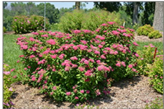
Double Play Red Spirea in bloom