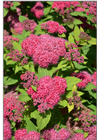
Double Play Red Spirea flowers

Double Play Red Spirea is recommended for the following landscape applications;