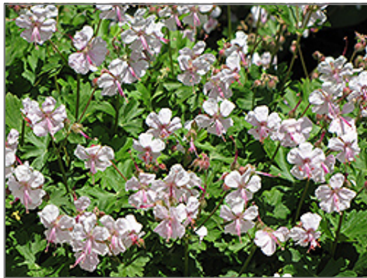
Biokovo Cranesbill in bloom

Biokovo Cranesbill will grow to be about 8 inches tall at maturity, with a spread of 18 inches. When grown in masses or used as a bedding plant, individual plants should be spaced approximately 15 inches apart. Its foliage tends to remain low and dense right to the ground. It grows at a medium rate, and under ideal conditions can be expected to live for approximately 10 years. As an evergreen perennial, this plant will typically keep its form and foliage year-round.