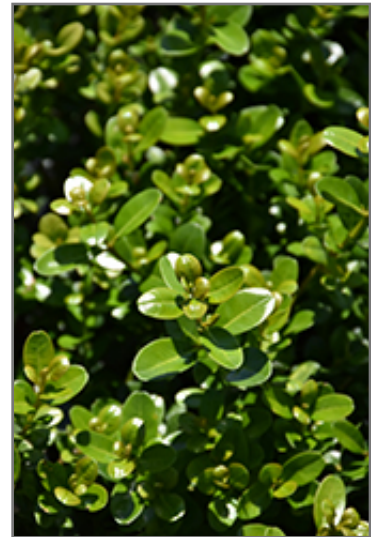
Sprinter Boxwood foliage