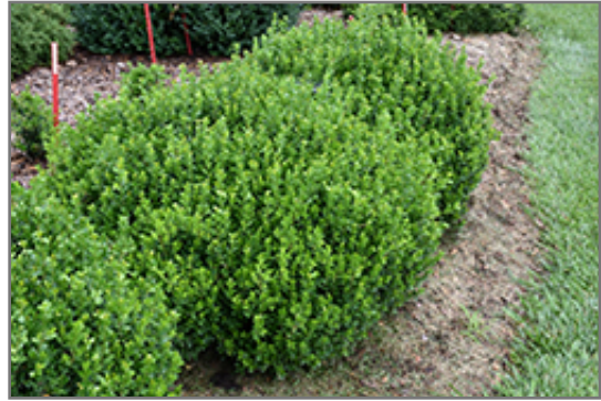
Sprinter Boxwood

Sprinter Boxwood is recommended for the following landscape applications;