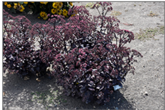
Cherry Truffle Stonecrop in bloom