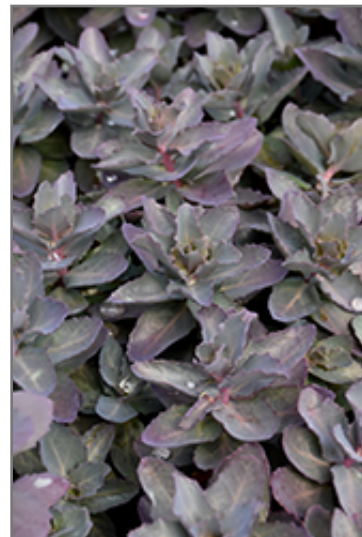
Cherry Truffle Stonecrop foliage

Cherry Truffle Stonecrop is a fine choice for the garden, but it is also a good selection for planting in outdoor pots and containers. It is often used as a 'filler' in the 'spiller-thriller-filler' container combination, providing a mass of flowers and foliage against which the larger thriller plants stand out. Note that when growing plants in outdoor containers and baskets, they may require more frequent waterings than they would in the yard or garden.