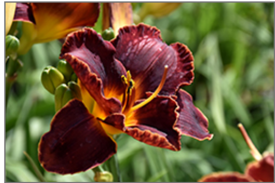
Night Embers Daylily flowers