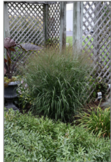
Prairie Winds Apache Rose Switch Grass