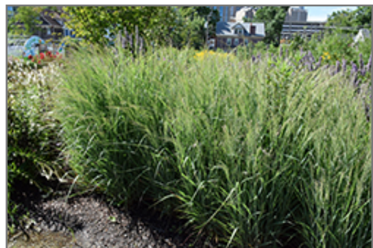
Prairie Winds Apache Rose Switch Grass