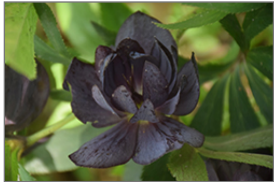
Wedding Party Dark and Handsome Hellebore flowers (faded)

Wedding Party Dark and Handsome Hellebore is recommended for the following landscape applications;