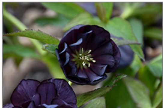
Wedding Party Dark and Handsome Hellebore flowers