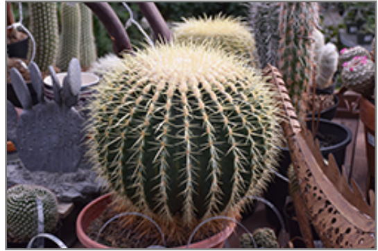
Golden Barrel Cactus in full

Golden Barrel Cactus is a succulent evergreen plant. It is a member of the cactus family, which are grown primarily for their characteristic shapes, their interesting features and textures, and their high tolerance for hot, dry growing environments. Like all cacti, it doesn't actually have leaves, but rather modified succulent stems that comprise the bulk of the plant, and which are designed to hold water for long periods of time. This particular cactus is valued for its distinctive barrel shape, and usually grows as a single spiny ribbed green stem. This plant has yellow cup-shaped flowers held atop the stems from late spring to early summer, which are interesting on close inspection.