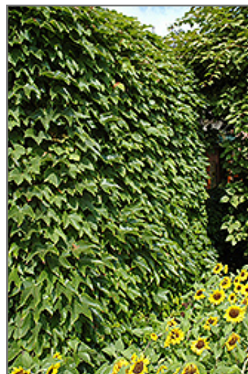
Boston Ivy

* This is a 'special order' plant - contact store for details