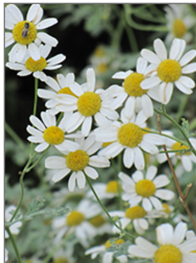
German Chamomile flowers