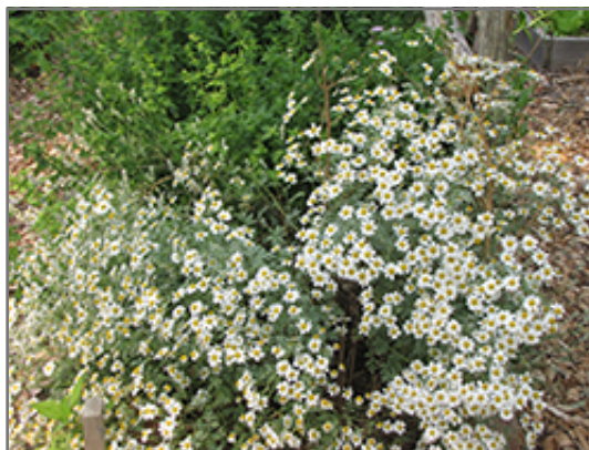
German Chamomile

This plant is quite ornamental as well as edible, and is as much at home in a landscape or flower garden as it is in a designated herb garden. It does best in full sun to partial shade. It is very adaptable to both dry and moist locations, and should do just fine under typical garden conditions. It is not particular as to soil type or pH. It is somewhat tolerant of urban pollution. This species is not originally from North America.