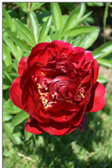
Buckeye Belle Peony flowers