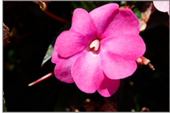
SunPatiens Compact Hot Pink New Guinea Impatiens flowers

SunPatiens Compact Hot Pink New Guinea Impatiens is recommended for the following landscape applications;