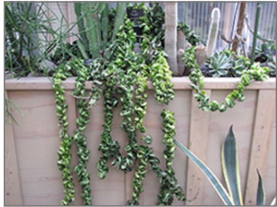
Hindu Rope Plant

When grown indoors, Hindu Rope Plant can be expected to grow to be about 12 inches tall at maturity, with a spread of 3 feet. It grows at a medium rate, and under ideal conditions can be expected to live for approximately 10 years. This houseplant should be situated in a location that gets indirect sunlight at most, although it will usually require a more brightly-lit environment than what artificial indoor lighting alone can provide. It is very adaptable to both dry and moist soil, but will not tolerate any standing water. The surface of the soil shouldn't be allowed to dry out completely, and so you should expect to water this plant once and possibly even twice each week. Be aware that your particular watering schedule may vary depending on its location in the room, the pot size, plant size and other conditions; if in doubt, ask one of our experts in the store for advice. It is particular about its soil conditions, with a strong preference for rich, acidic soil. Contact the store for specific recommendations on pre-mixed potting soil for this plant.