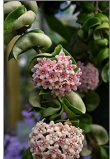
Hindu Rope Plant flowers

This is an herbaceous houseplant with a spreading, ground-hugging habit of growth. This plant usually looks its best without pruning, although it will tolerate pruning.