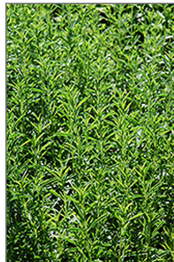
Winter Savory