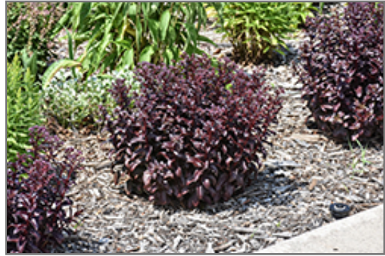
Dark Magic Stonecrop in bloom

Dark Magic Stonecrop will grow to be about 12 inches tall at maturity, with a spread of 20 inches. When grown in masses or used as a bedding plant, individual plants should be spaced approximately 16 inches apart. It grows at a fast rate, and under ideal conditions can be expected to live for approximately 15 years. As an herbaceous perennial, this plant will usually die back to the crown each winter, and will regrow from the base each spring. Be careful not to disturb the crown in late winter when it may not be readily seen!