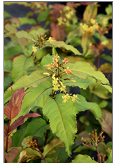
Kodiak Fresh Diervilla flowers