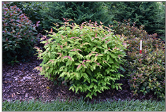
Kodiak Fresh Diervilla

Kodiak Fresh Diervilla makes a fine choice for the outdoor landscape, but it is also well-suited for use in outdoor pots and containers. Because of its height, it is often used as a 'thriller' in the 'spiller-thriller-filler' container combination; plant it near the center of the pot, surrounded by smaller plants and those that spill over the edges. It is even sizeable enough that it can be grown alone in a suitable container. Note that when grown in a container, it may not perform exactly as indicated on the tag - this is to be expected. Also note that when growing plants in outdoor containers and baskets, they may require more frequent waterings than they would in the yard or garden.