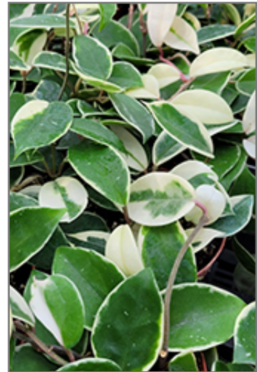
Krimson Queen Wax Plant foliage

This is an herbaceous houseplant with a spreading, ground-hugging habit of growth. This plant may benefit from an occasional pruning to look its best.