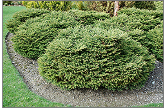
Creeping Norway Spruce