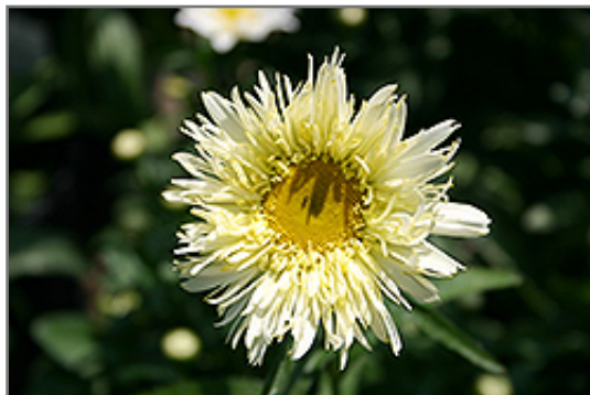
Gold Rush Shasta Daisy flowers